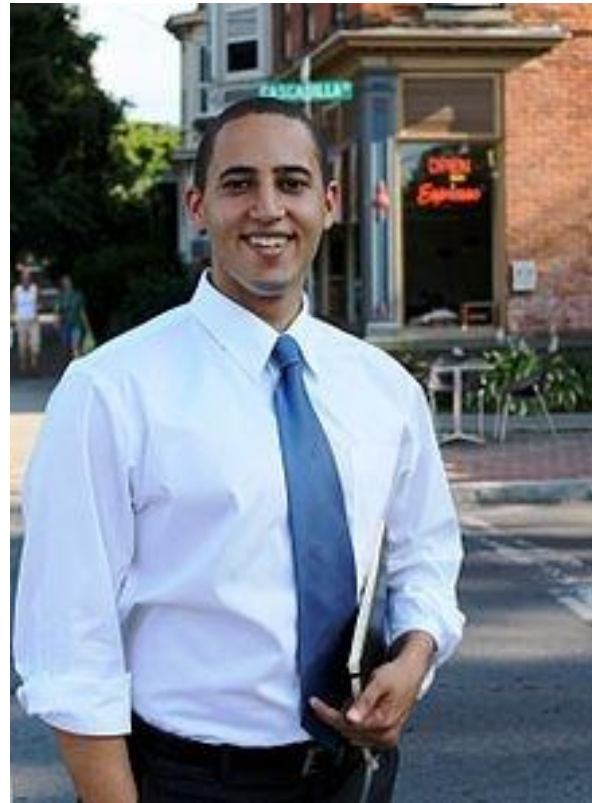
Mayor Svante L. Myrick, City of Ithaca